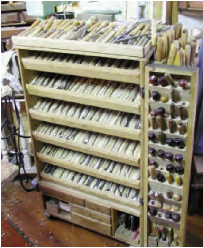
One of Fred's tool cabinets, work area, study materials and speciality tools.