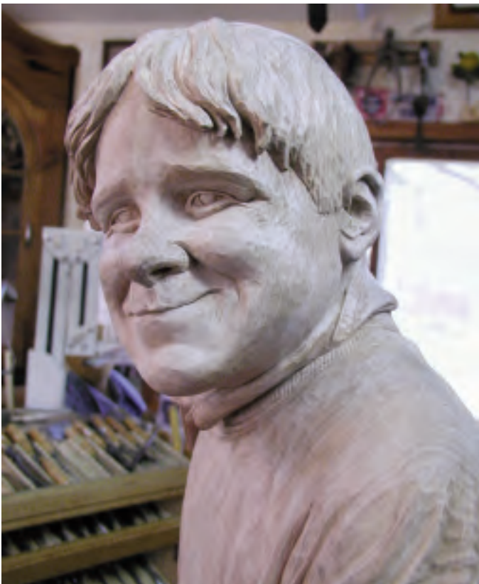
Mark Twain in Basswood