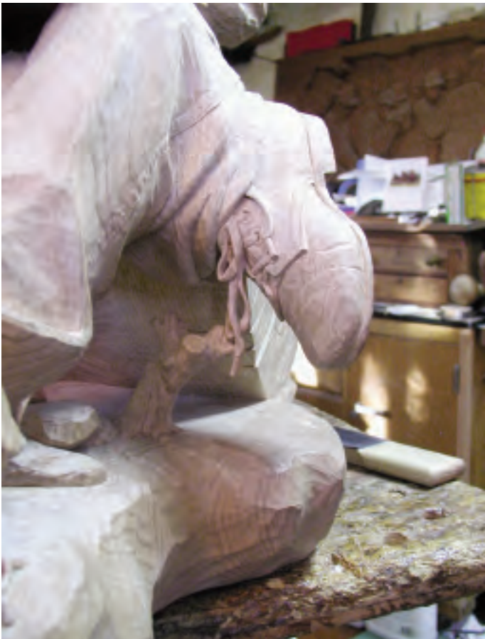
The amazing detail of Fred's carving.